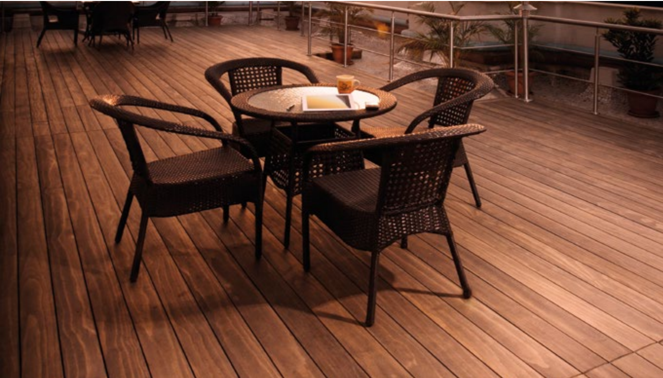
Top floor of prestigious downtown commercial building, Mumbai, India The challenge was to construct a wooden floor which can stand over 2m of rain every year, meaning any material used must cope with significant levels of precipitation, as well as related drainage.

In specifying decking, beauty, strength and all-weather performance are important. A material that that is durable, stable and beautiful is desirable. It is also crucial that the wood is non-toxic and therefore totally safe for people and pets. For treatment recommendations of Accoya wood for decking please contact your Teknos representatives.