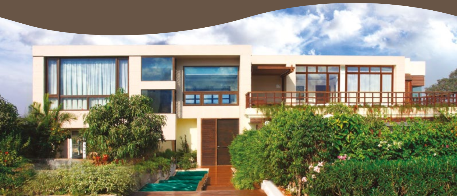
Weekend farmhouse, Panvel, India The climate in this area of India is tropical with heavy winds during monsoon seasons. The timber and system coatings used for construction projects situated in such varying weather conditions have to be exceptionally durable and stable. Accoya® with Teknos translucent coatings TEKNOS AQUA 2907 and AQUATOP 2600 complements the natural surroundings of the farmhouse.

Exterior joinery, manufactures from Accoya® and fully protected by Teknos coating systems, would be expected to give a service life of 60 years if the manufacturer’s maintenance procedures are followed.