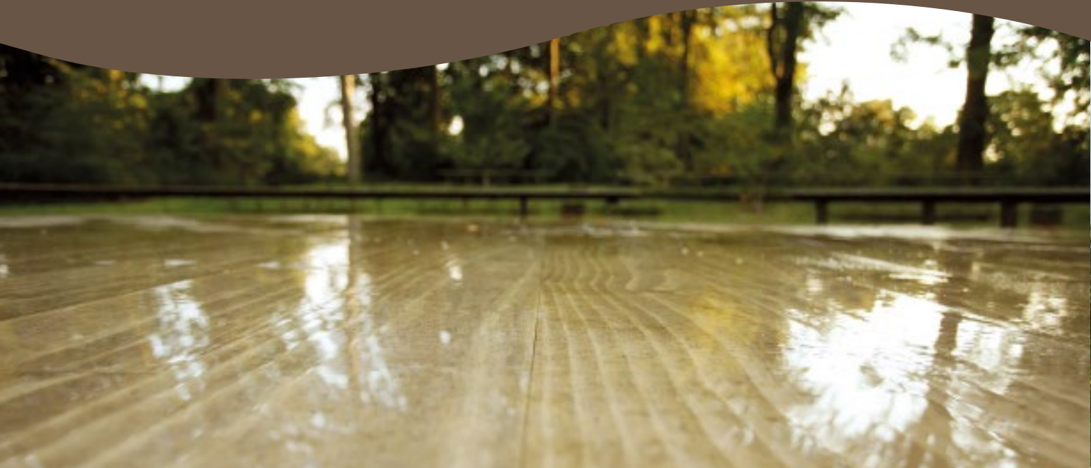
Outdoor dance floor in rainy Copenhagen, Denmark Accoya® outdoor dance floor survives the wet climate of Copenhagen: two and half years on the dance floor has undertaken all sorts of weather conditions and frequent foot flow and yet still remains stable and in very good condition considering the external environment.

In specifying decking, beauty, strength and all-weather performance are important. A material that that is durable, stable and beautiful is desirable. It is also crucial that the wood is non-toxic and therefore totally safe for people and pets. For treatment recommendations of Accoya wood for decking please contact your Teknos representatives.