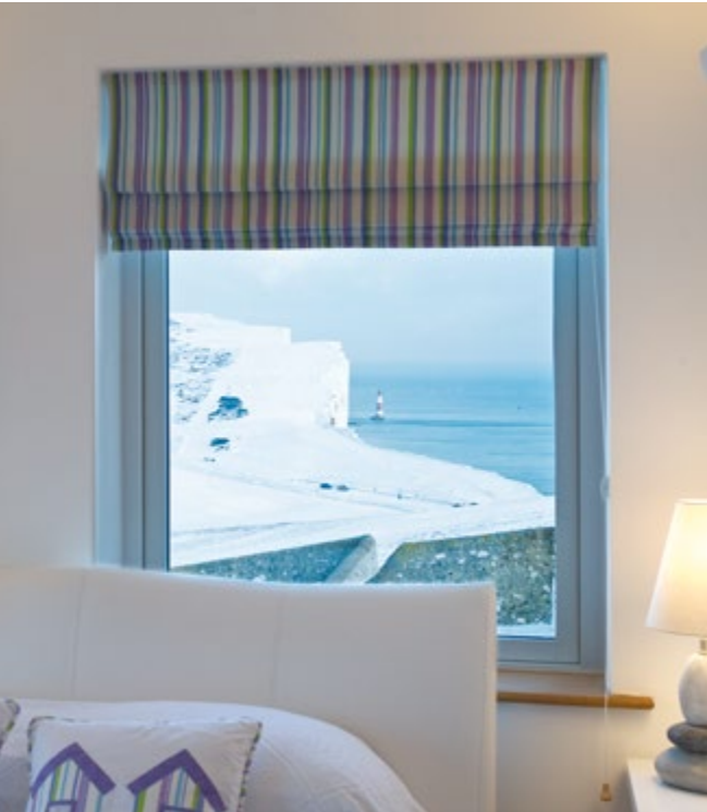
Belle Tout lighthouse hotel, Great Britain Accoya® wood windows with a Teknos coating was the ideal solution in this extreme environment. A recent review 2.5 years after the window and door installation showed there was no signs of rot or decay or coating degradation in this ever-changing tough climate.

The durability of translucent coatings is shade dependent and lower than that for opaque colours. Generally darker translucent shades will give a longer life to first maintenance than lighter shades.