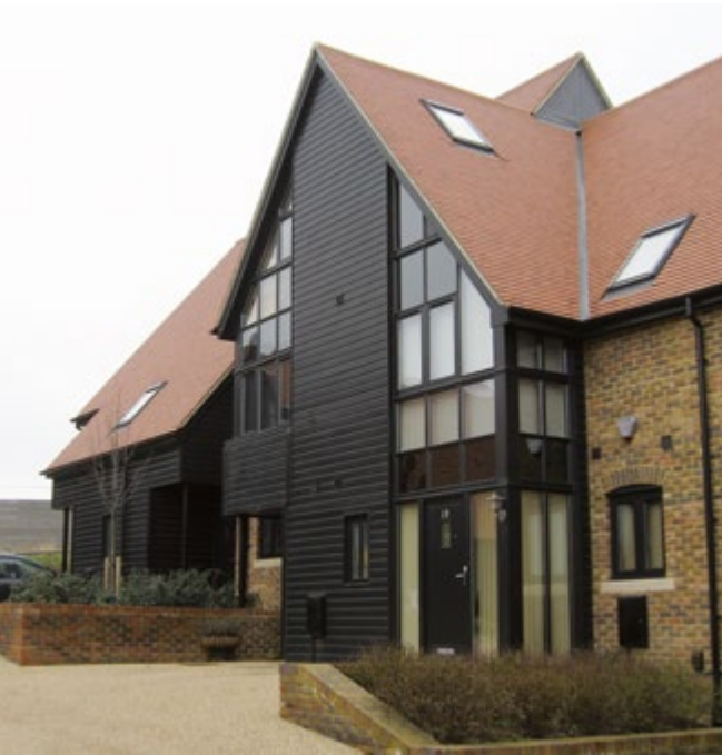
Bellway Homes in Purfleet, Essex, Great Britain The wood was to be coated with a challenging black finish (dark coatings readily absorb sunlight) and stability was therefore critical. A recent review of these stunning 19 homes in 2012 found that the Accoya® wood used was still looking superb with excellent colour retention and no signs of rot or decay.

Accoya® wood is a perfect solution for exterior cladding, siding and façades where aesthetics, less frequent maintenance, dimensional stability, durability and insulation value are key factors. Accoya® woods versatility makes it ideal for use in residential, commercial and industrial structures