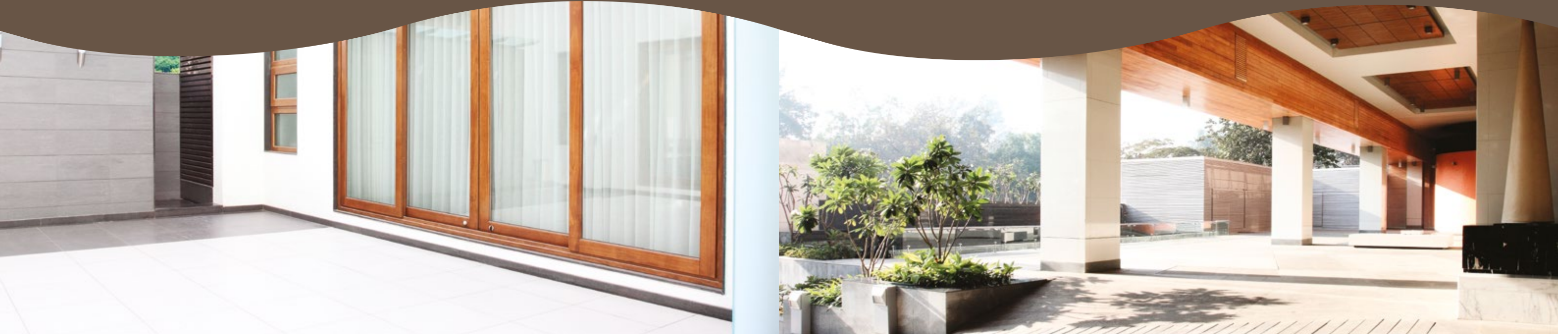
Private residence, India The residence needed a premium and unique look to complement the other wood and luxury interior furnishings. With the Indian climate so prone to change, any material used must be up to the challenge of facing varying and extreme weather. Accoya® coated with AQUA PRIMER 2907 and AQUATOP 2600 wood was the answer.